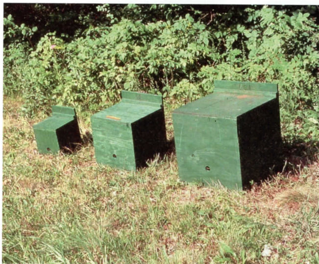
Bait hives used to determine what size cavity honey bees prefer when they get to choose their own nest site. The bait hives had volumes of 10, 40 and 100 liters (0.35, 1.4, and 3.5 cubic feet). Swarms usually chose the middle sized one.

Now that you know what bees seek in a home, you are ready to build your bait hives. You may find it easiest to use some of your old hives, because there will be a strong and attractive odor of beeswax inside them. I have made many of my bait hives out of old, full-depth, 10-frame Langstroth hives. They have a volume of 1.5 cubic feet. But I favor making my bait hives out of old "nucleus hives" that hold five or six frames and have a volume of