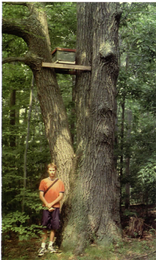
Bait hive mounted on a simple platform at a suitable height in an oak tree. Notice the small entrance opening, as preferred by the bees. This bait hive has been repeatedly occupied by swarms.

about one cubic foot. Both sizes of bait hive are attractive to the bees, but the smaller ones are much easier to set up, take down, and transport. If you use old hives, make sure to reduce the size of the entrance to about two square inches by blocking off most of the original entrance opening. Reducing the entrance opening to this size is VERY important. You will also want to attach the bottom board to the rest of the hive, so that it will be easy to move the whole thing about. Another way to convert an old hive