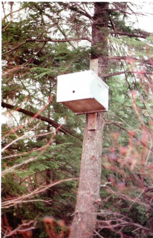
Bait hive built from an old Langstroth hive, with an entrance hole drilled on the front and boards nailed on the top and bottom.

about one cubic foot. Both sizes of bait hive are attractive to the bees, but the smaller ones are much easier to set up, take down, and transport. If you use old hives, make sure to reduce the size of the entrance to about two square inches by blocking off most of the original entrance opening. Reducing the entrance opening to this size is VERY important. You will also want to attach the bottom board to the rest of the hive, so that it will be easy to move the whole thing about. Another way to convert an old hive